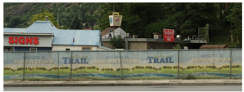
Trail, BC applies colourful screenings over chain-link fences surrounding vacant land to add visual appeal to the public realm.

1. For sites that are fenced, place screenings to add colour and visual interest to unappealing sites.